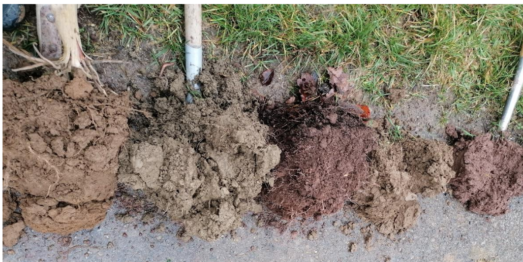
Figure 2. Spade tests used for VESS assessment of five land use and management systems.