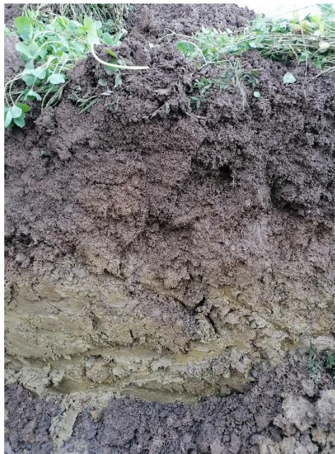
Figure 1. Representative soil profile at the site where VESS assessment has been done for different soil use and management systems.