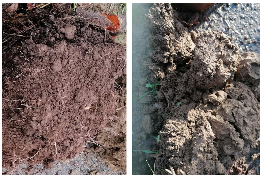
Figure 3. Spade sample with highest (left; forest soil: VESS SQ 1) and lowest (right; bare soil after corn harvest; VESS SQ4) score attributed by 30 participants in a soil health course.

The scoring by the participants showed high agreed in the attribution of VESS scores, besides the arable soils with triticale-pea (recently sown) and the bare arable soil after corn harvest which showed lowest differentiation and thus some overlap in the scoring. This first testing indicated that VESS scoring guided by a mobile app can effectively provide a standardized soil structure assessment by farmers/advisers. Subsequent tests in the samples with simple field methods for soil organic matter (NaOH and KMnO_4 extracts) and soil biological